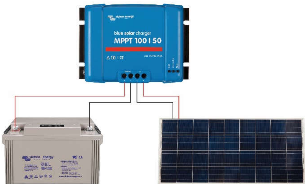
Figure 1: Power connections